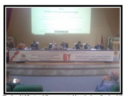
he four IAJ Regional Groups met in Marrakesh on October 14°

During the Marrakesh meeting the EAJ adopted following resolution concerning Poland: